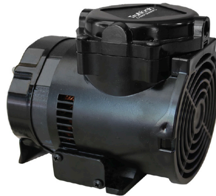
Part Number: 32213