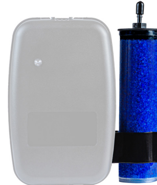
Intake Air Dryer Cartridge Kit