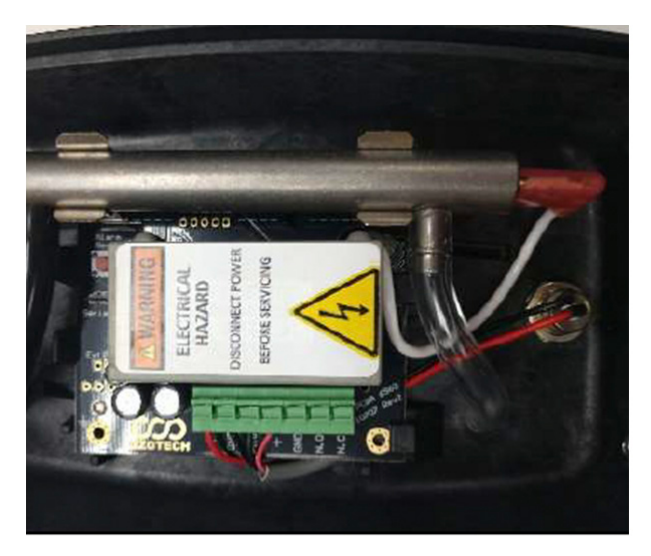
New CD cell as installed on the EOG 200